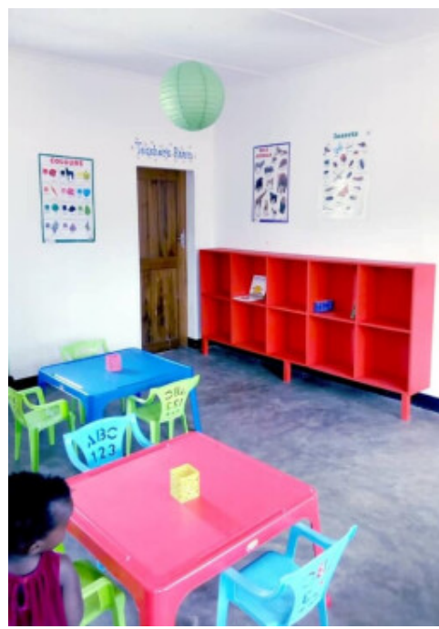
Making divider for 3-4 yr olds and 5-7 yr olds