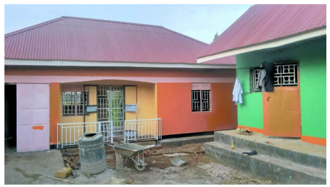
The finished orphanage in Mityana, Uganda