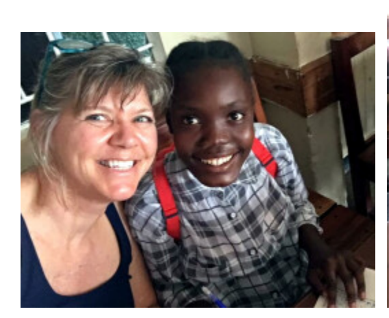
1/23/2020 - Some favorite pictures from our stay at Kabwata Orphanage