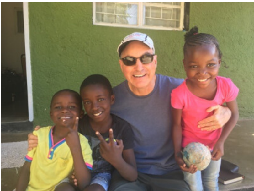
Children from Kabwata Orphanage in Zambia