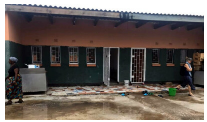
Future "Eugene School"

During our last day at Kabwata Orphanage we polished things up in the classroom. We are all so happy with what we could do with the time we had. We are so thankful to God for allowing us to be part of this project!